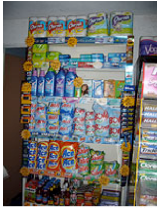
Procter & Gamble

Though the agents' jobs can be lucrative, the barriers to entry are high.