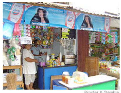
High-frequency stores in Asia, including this one in the Philippines, often hang products from the ceiling; this fall, P&G will try such arrangements in Latin America.

P&G touts other advantages, too: Household cleaners and beauty products bring a higher profit margin than food, candy and soda. And when products are arranged as P&G suggests, sales of those items increases 29%, the company claims to owners.